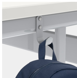
Includes one satchel hook per seat