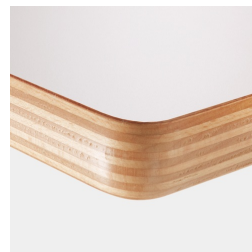
Optional table top multiplex melamine coated