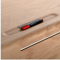
Pen tray included