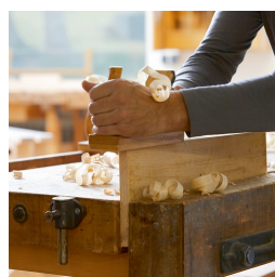
Solid beech wood from sustainable forestry with water-based varnish