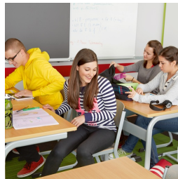
No disturbance of the chair legs when getting in and out of the chair