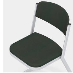
With seat and backrest upholstery