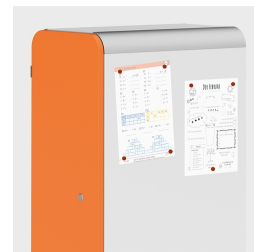
Optionally with magnetic pages