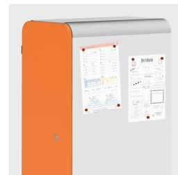
Optionally with magnetic pages