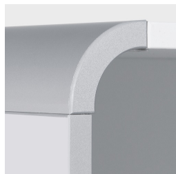
Rounded aluminum profile corners