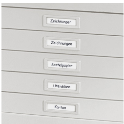
Labeling field for easy identification