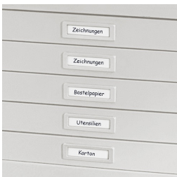
Labeling field for easy identification