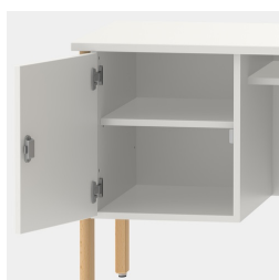
Base cabinet includes one shelf, lockable by means of security lock