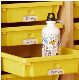
robust Tidy Boxes