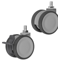
Mobile on 4 castors, 2 of which are lockable