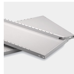
Stable steel bases

Our range of materials and colors can be found in the A2S material overview.