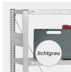
Robust steel frame