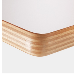
Optional table top multiplex melamine coated