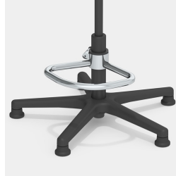
Optionally with partial foot ring