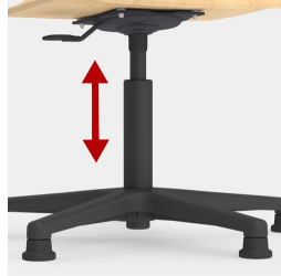
Height adjustment by safety gas spring