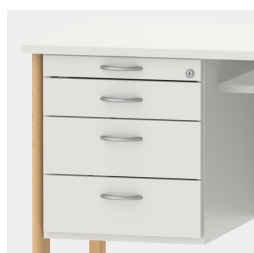
Base unit includes pencil drawer and drawers with soft-closing mechanism and central locking system