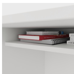
Including practical tray