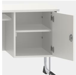
Base cabinet includes one shelf, lockable by means of security lock