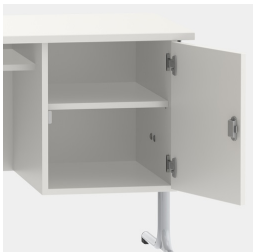
Base cabinet includes one shelf, lockable by means of security lock