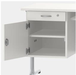
Base cabinet includes drawer, lockable by means of safety lock