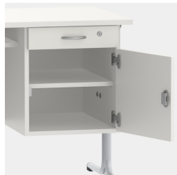
Base cabinet includes drawer, lockable by means of safety lock