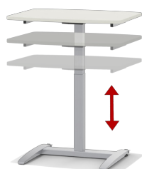
Infinitely variable height adjustment in the range 70-110 cm