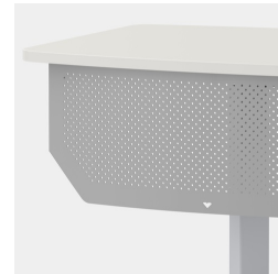
Perforated plate front panel included