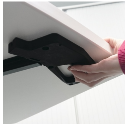
Safety hand release prevents unintentional triggering of height adjustment