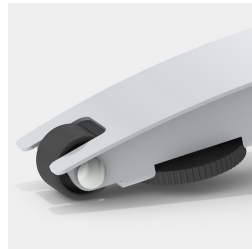
Mobile due to 2 casters on the rear edge of the base, with slight incline