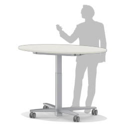
Can also be used as a mobile lectern