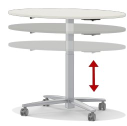
Infinitely height adjustable in the range 71-110 cm