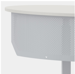
Front panel made of perforated metal included