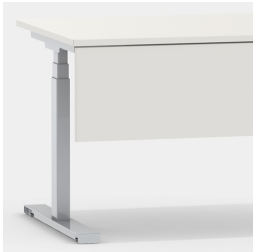
Matching accessories: front panel model 2050.202 and side panel model 2050.162