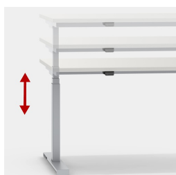
Infinitely and quietly height adjustable in the range 62-127 cm