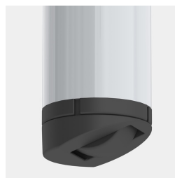
Optional frame mobile by means of 2 rollers