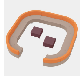
Can be individually extended with MAZE and straight DOMINO seating elements