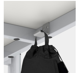
Optionally with one folder hook per seat