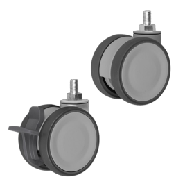
Mobile on 4 castors, 2 of which are lockable