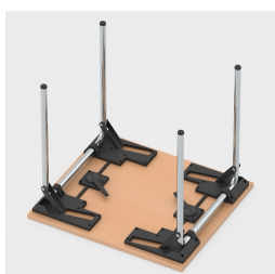
Easy folding of the table legs