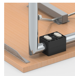
Stacking protectors protect the table top from scratch marks