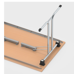
Easy folding of the table legs