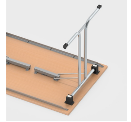
Easy folding of the table legs