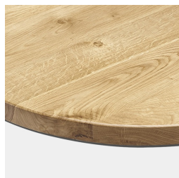
Optionally with solid oak table top