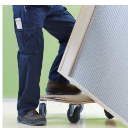
Carcass firmly doweled and glued ex works