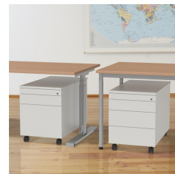
Suitable for our OFFICE desks and 1000 and 2000 desk series