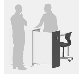
Can be used as a counter at the desk while standing