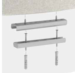
Optionally with screwed or glued floor fastening