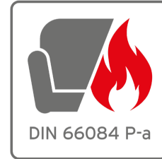
Optionally fire protection certified according to DIN 66084 P-a with cover fabric B1