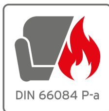
Optionally fire protection certified according to DIN 66084 P-a with cover fabric B1