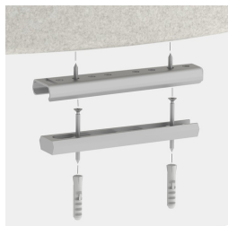
Optionally with screwed or glued floor fastening