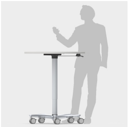
Can also be used as a mobile lectern