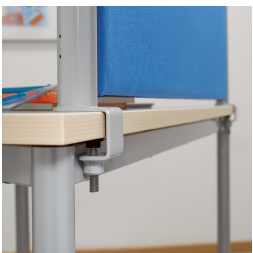
Mounting by means of Allen screw on the table top