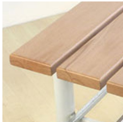
Edges rounded on all sides