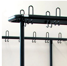
with double coat hook