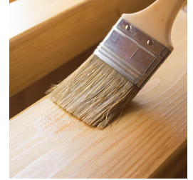
Painted with environmentally friendly water-based paint.