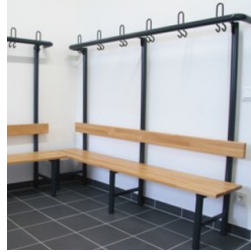
Ideal for changing rooms