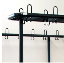
with double coat hook