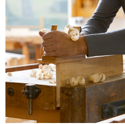
Solid beech wood from sustainable forestry with water-based varnish