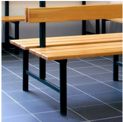
Can be used on both sides - continuous frame