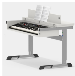
Integrated music stand