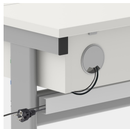
Concealed cable management through energy channel