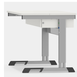
High legroom when closed