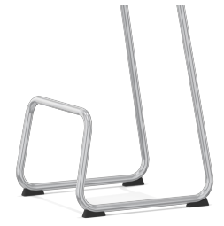
Robust sled frame