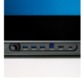
Connections integrated directly in the housing