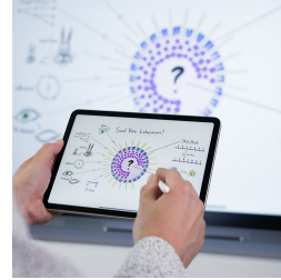
Simple screen transmission from all end devices