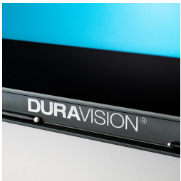
Full-length storage strip for pens