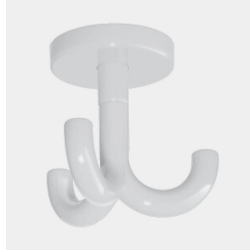
3 wardrobe hooks for all the children's clothes.