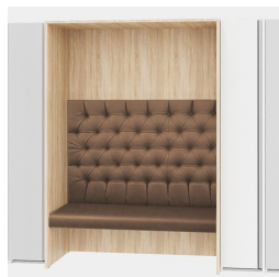
Optionally with button upholstery in PLASTIC LEATHER B1.