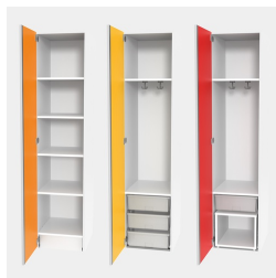
In 3 different equipment variants.