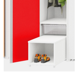
Pull-out stool that provides non-slip support.